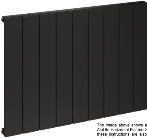
The image above shows an AluLite Horizontal Flat model but these instructions are also suitable for various other models using the same bracket set.